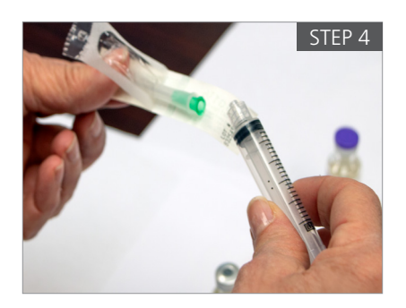
Remove the syringe from the packaging and remove the syringe cap