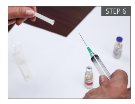
Remove the cap from the needle