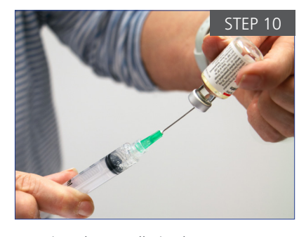
Keeping the needle in the stopper, invert the vial and syringe. Pull back the plunger until the medicine fills to the prescribed volume