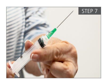
Pull back plunger to the prescribed volume and fill syringe with air