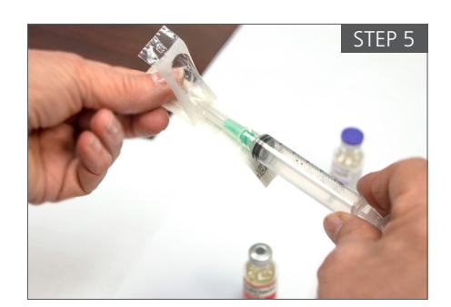
Open the needle wrapper holding by the capped end. Place the needle onto the syringe opening and twist to lock into place. Never handle the needle directly