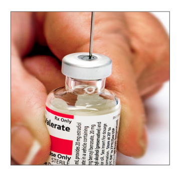
Bring the syringe up to a 90° angle (vertical)