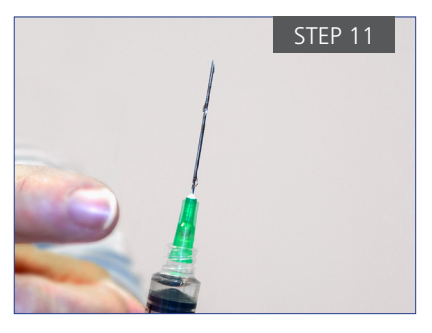
Remove the syringe from the vial

Prepare for injection per your provider's instructions.